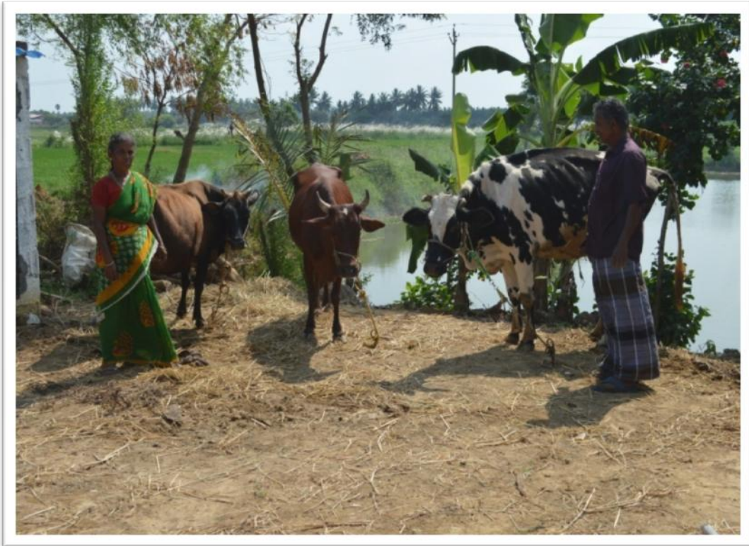
COWS MAINTAINED BY THE FARMER