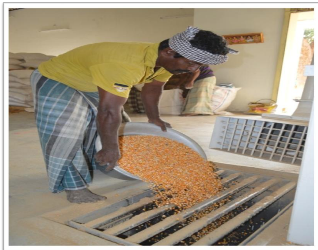
GRINDING OF FEED INGREDIENTS