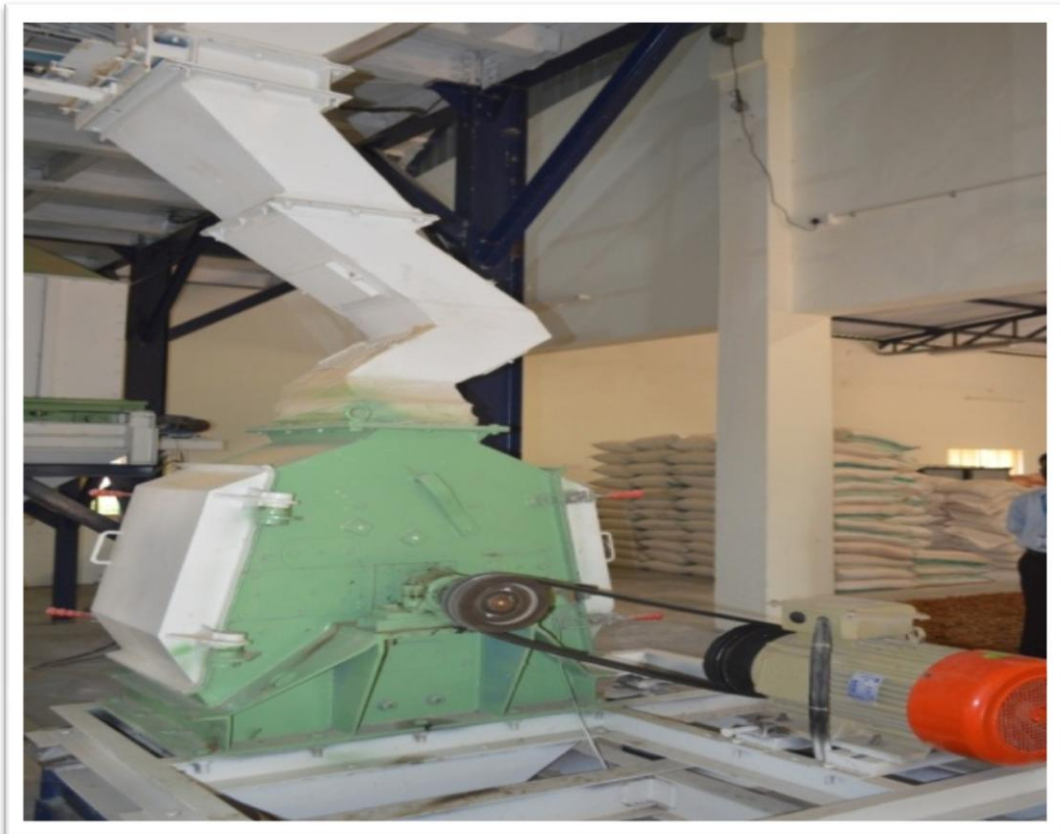
FEED PROCESSING EQUIPMENTS - GRINDER