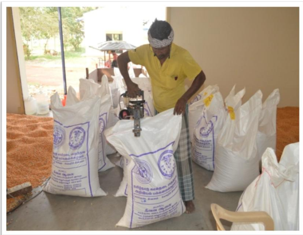
SEALING OF BAGS