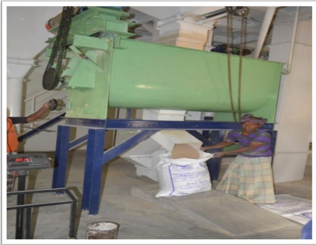
PACKING OF COMPOUNDED FEED