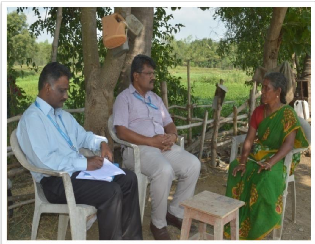
SUCCESS STORY DOCUMENTATION