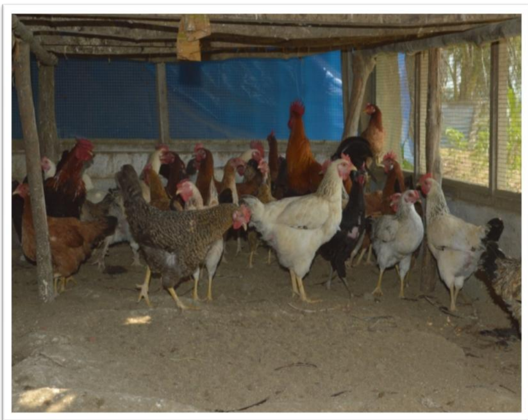
LAYER BIRDS MAINTAINED BY THE FARMER