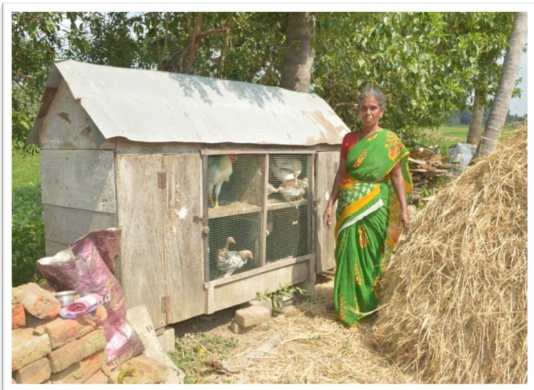
OLD SHED WHERE POULTRY REARING IS STARTED