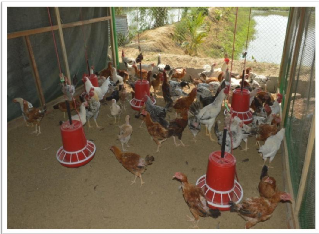
FEEDING OF GROWER CHICKEN