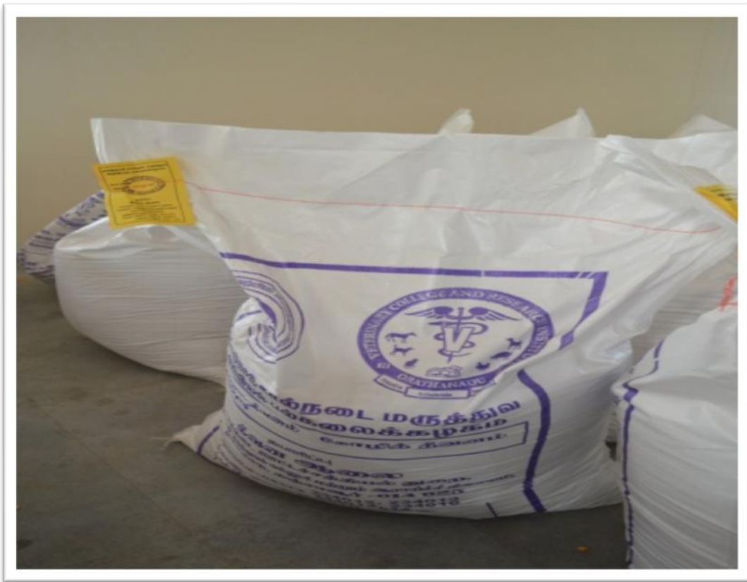
PACKED CONCENTRATE FEED