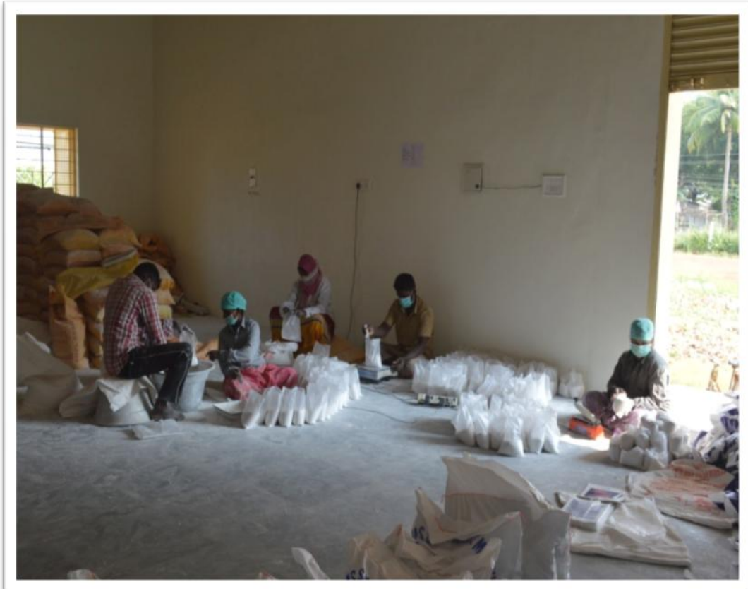
PREPARATION OF MINERAL MIXTURE