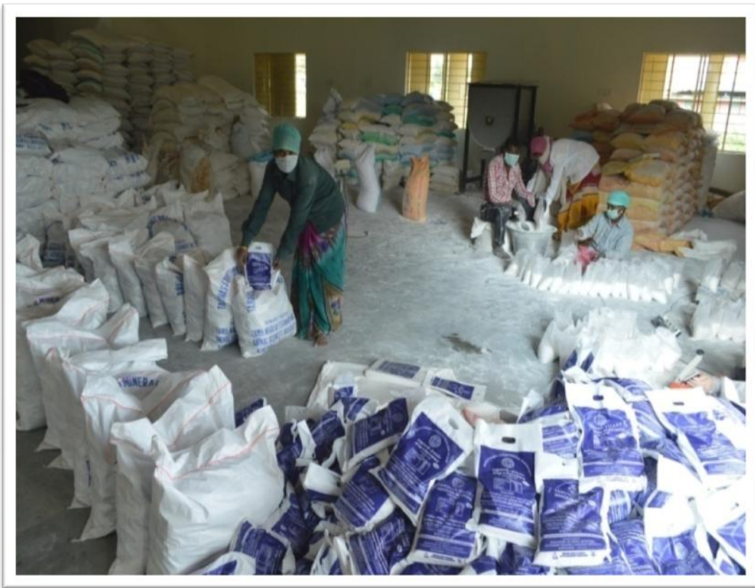
MINERAL MIXTURE PACKETS