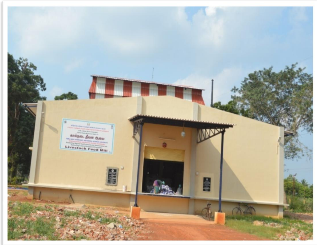
FEED PROCESSING UNIT

supplied to the farmers of Cauvery delta region for sustainable livestock production. In addition training is provided to the farmers and entrepreneurs regarding feed preparation and feeding management of livestock and poultry.