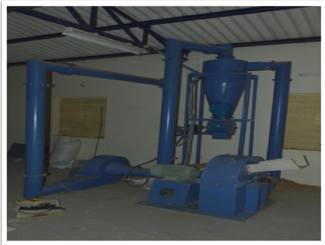
COMPLETE FEED BLOCK UNIT - PULVERIZER