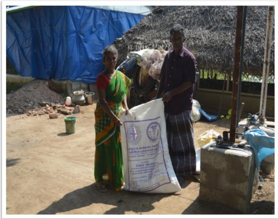
FEED PURCHASED FROM FEED PROCESSING UNIT, DEPT. OF ANIMAL NUTRITION, VCRI, ORATHANADU