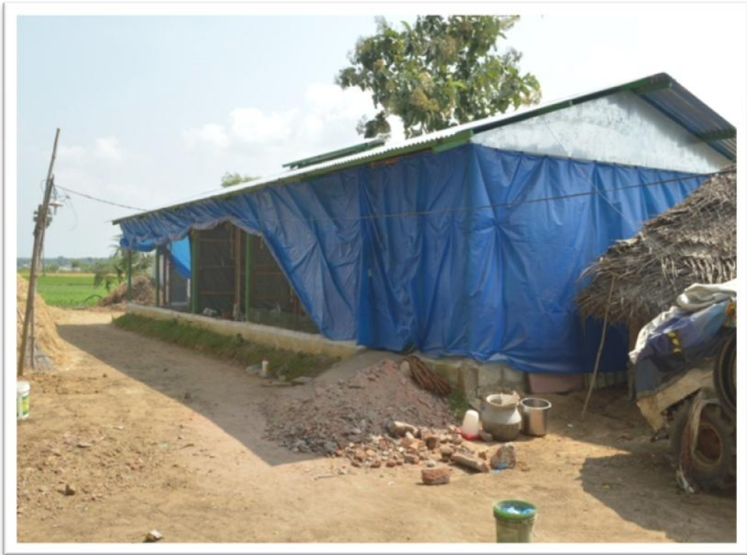
NEW SHED ESTABLISHED FOR REARING BIRDS