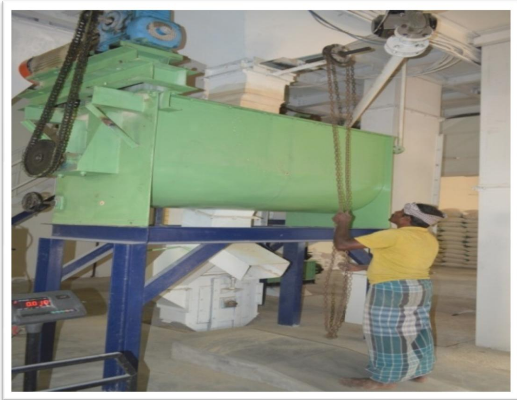
FEED PROCESSING EQUIPMENTS – MIXER