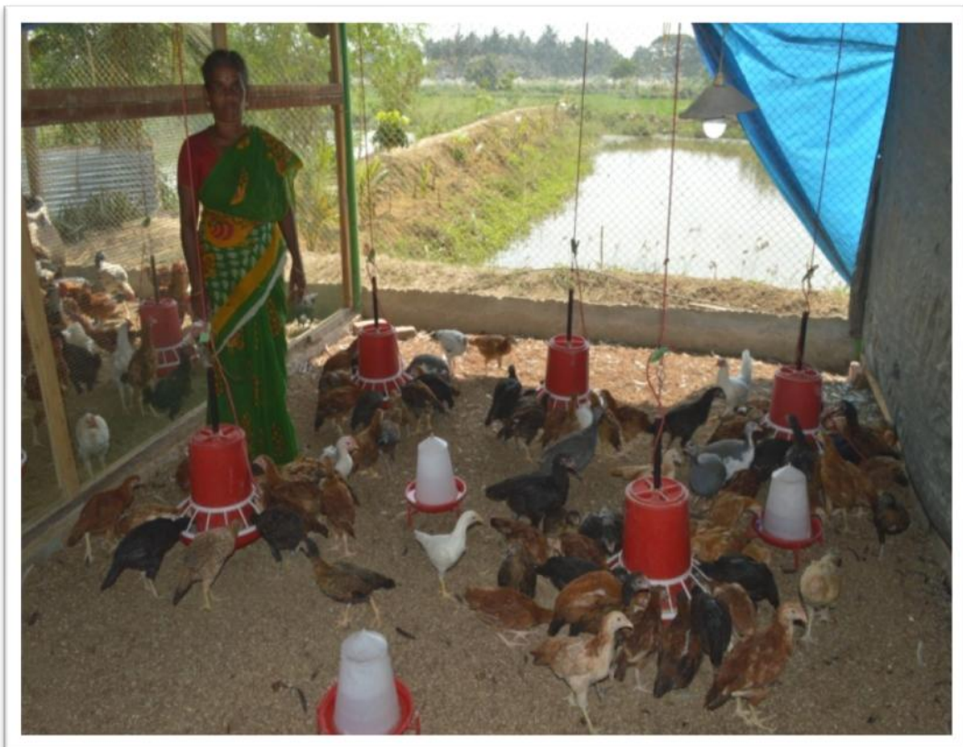
FEEDING OF GROWER CHICKEN