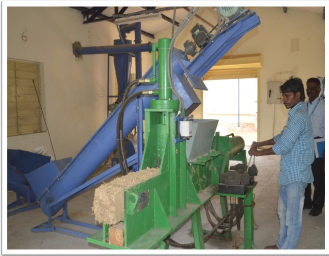
FEED BLOCK MAKING UNIT